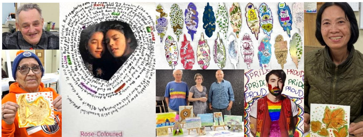
Words and Pictures: Our Stories, Gratitude Feathers, Coffee-painted leaves, Year-end Art Show